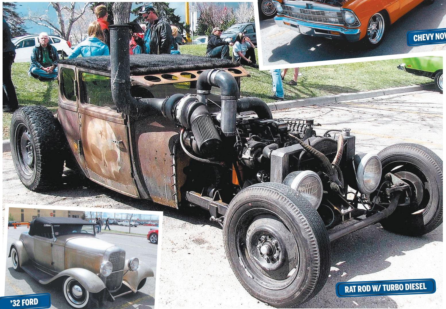
RAT ROD W/ TURBO DIESEL